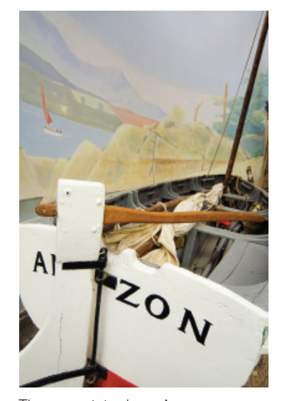
original Amazon Windermere Steamboat Museum.

Swallows and Amazons Voyage I - 'A Lake as Big as an Inland Sea' - Windermere Swallowdale Winter Holiday Pigeon Post The Picts and the Martyrs Voyage 2 - Coniston Water Mixed Moss - Arthur Ransome's life and the background to the stories