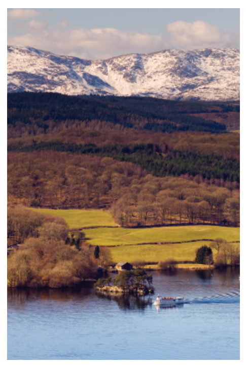
Launch on Windermere with snow on the Coniston Fells behind.