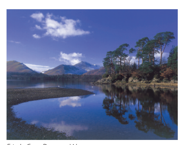
Friar's Crag, Derwent Water.