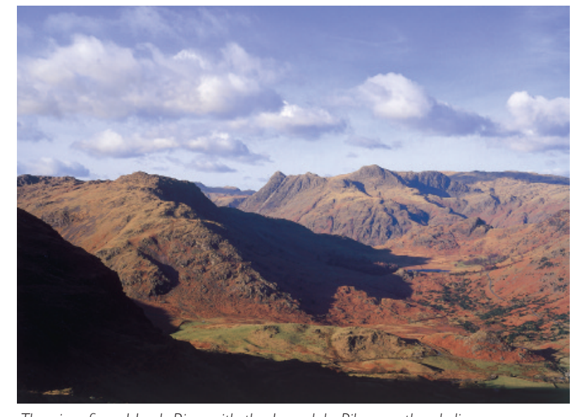
The view from Hawk Rigg, with the Langdale Pikes on the skyline.